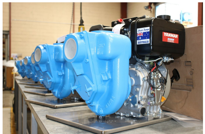
3" cast iron semi trash pump B3XR-A/ST Yanmar

Due to our program of continuous product development the manufacturer reserves the right to alter specifications without notice.