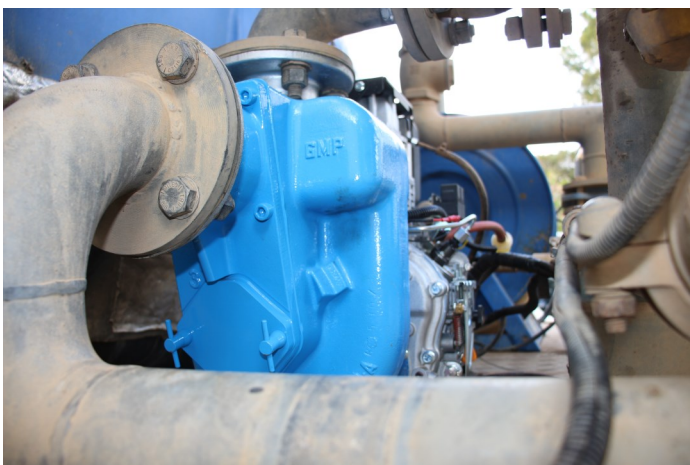
Tanker installation (B3XR-A/ST Yanmar)

Curves should be used as a guide only, for detailed performance curves contact Aussie Pumps